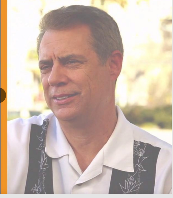
Click to open video in browser

How are you helping to protect your way of life?